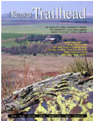
Electronic Newsletter subscription